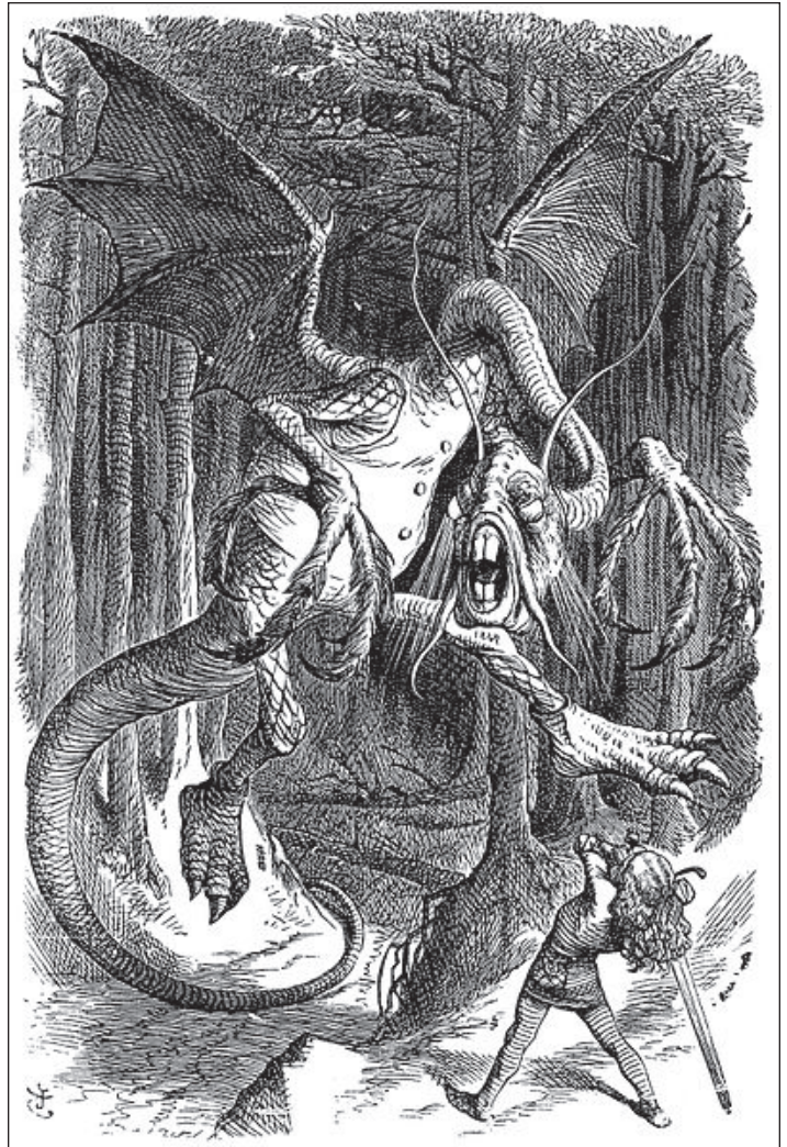
The Jabberwock, by John Tenniel, an illustration for Lewis Carroll's wonderful nonsense poem in Through the Looking-Glass . Our title (O frabjous day! Callooh! Callay!) is one line from the poem, celebrating the slaying of the Jabberwock. I use it here to celebrate the slaying of our 15 year-old "Jabberwock".

"Ouch!", you say. That's precisely what I said. However, when I got the proof from the printer the other day, my "Ouch!" was totally erased by the shock and awe of holding the 9"x12", 300 page, 2½ pound book. When I brought it to the meeting last Saturday of our Project's Editorial Board, the reaction was universal: startled gasps of amazement. This will be your reaction, as well. So come to the meeting/party on March 16 and don't forget your checkbook.