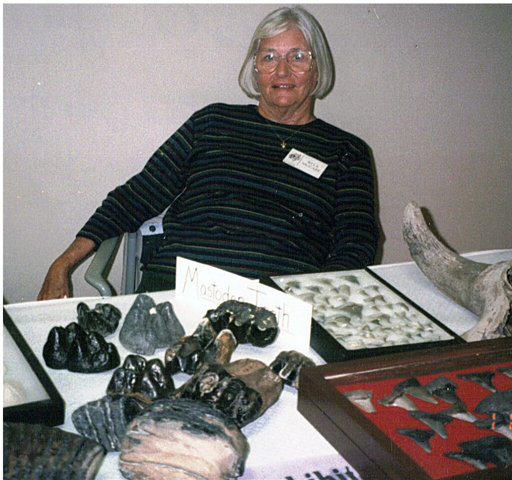
NORTH CAROLINA FOSSIL CLUB